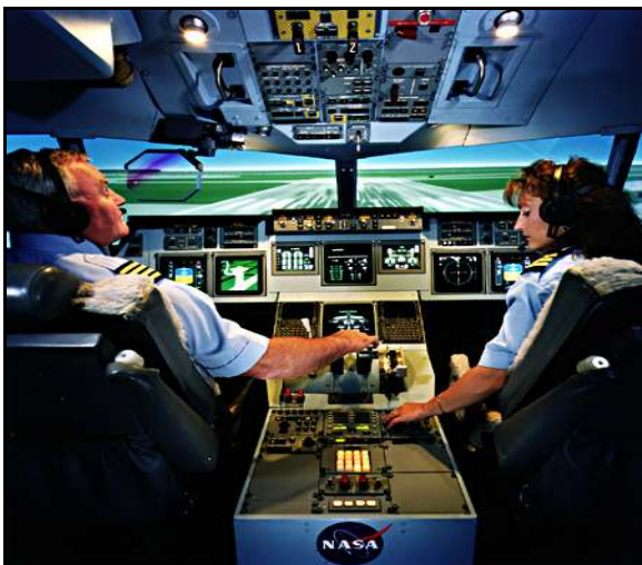
Figure 1 Flight Simulator (NASA)